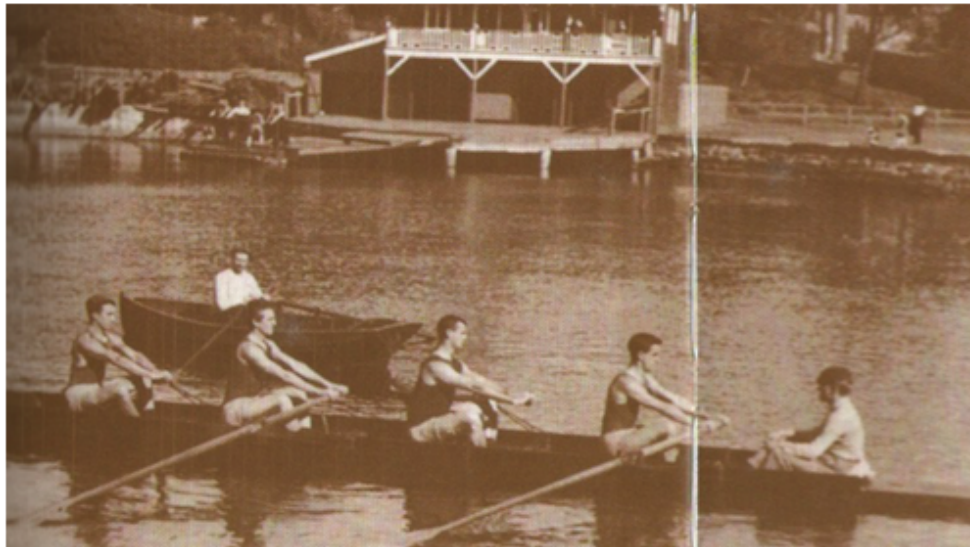
North Shore Rowing Club, Careening Cove