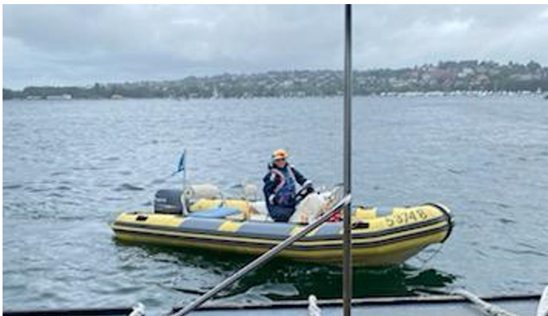
Can't do it without our fabulous SFS volunteers Thanks Barley!

Despite the murky day and tricky breeze, everyone enjoyed the day, none more so than the Alruth crew. Thanks as always to the volunteers for making it all possible.