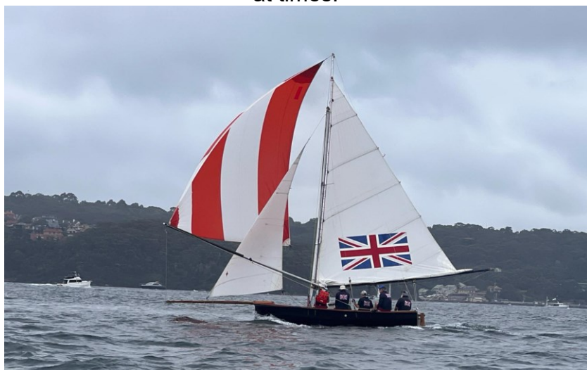
Top Weight (aka AUSIV).

Alas, the big winds did not eventuate leaving the boats under-rigged and becalmed at times.