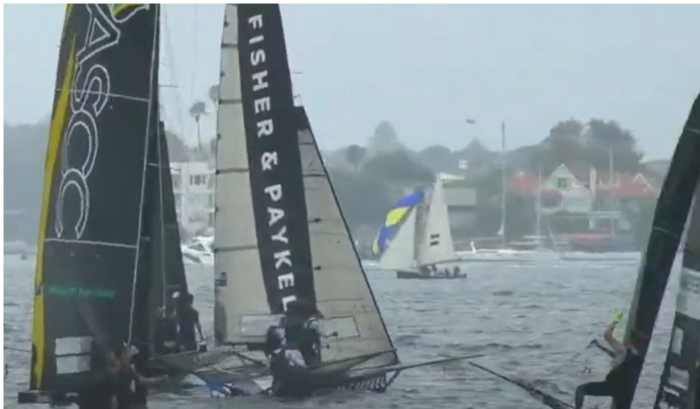
A sneaky peek through the modern 18's showing Tangalooma leading the fleet at this stage, with spinnaker set heading from Clark Island to Chowder Bay. Photo from YouTube.com:18footersTV: JJ GILTINAN CHAMPIONSHIP - Race 1 .

Tangles and The Mistake led the charge to Clark Island with Alruth passing Australia who found the doldrums as they rounded the Island. The leaders promptly set their kites to starboard, gybing half way to the Chowder Bay mark with no change in the line up until the work to Shark Island where Alruth took a convincing lead which they maintained for the run back down to Kurraba.