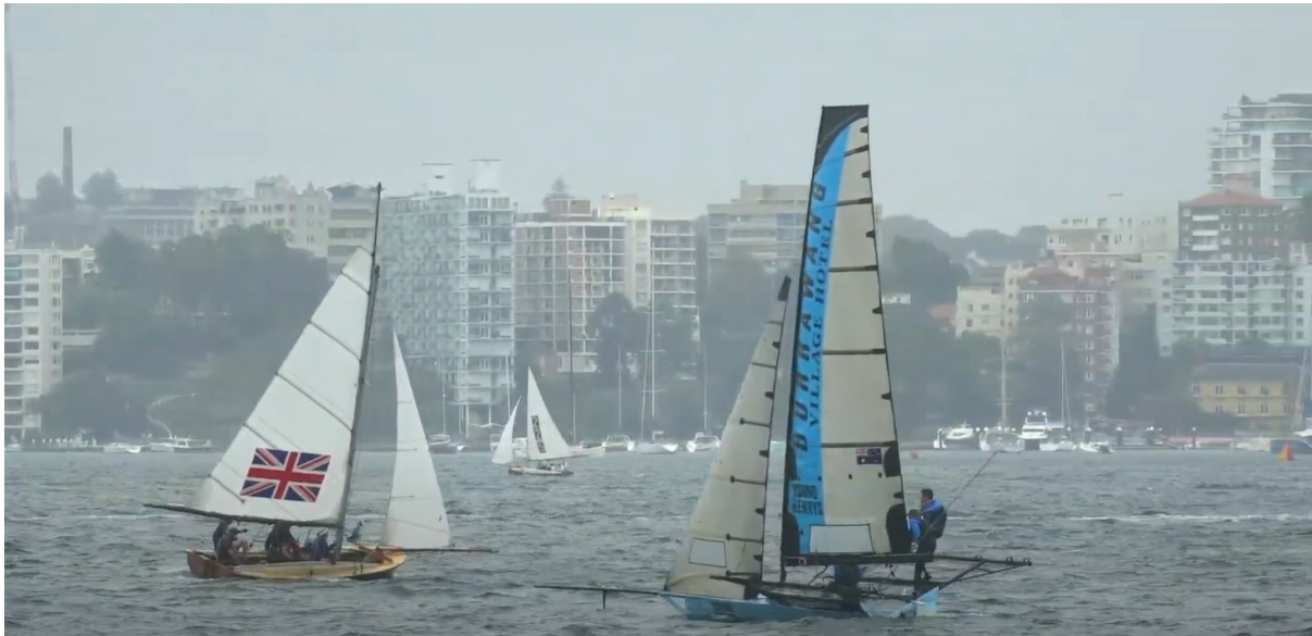
Top Weight (aka Australia IV) on the work up to Clark Island and The Mistake in the background, having already rounded Clark Island.

S The course has been shortened. Rule 32.2 is in effect.