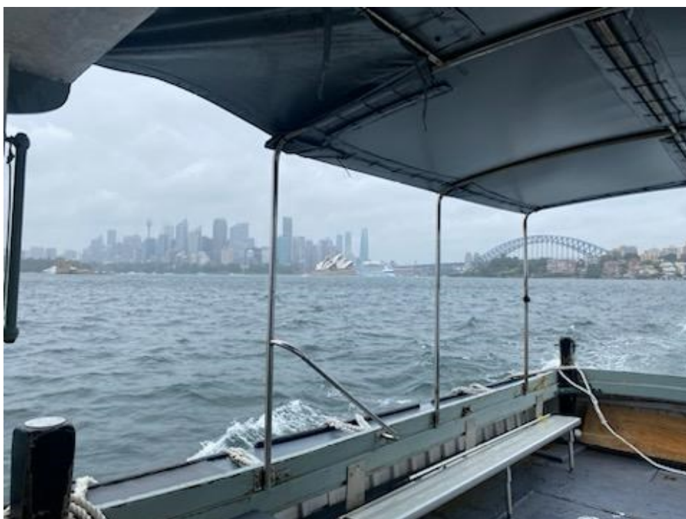
The view from the best harbour cruise in Sydney.