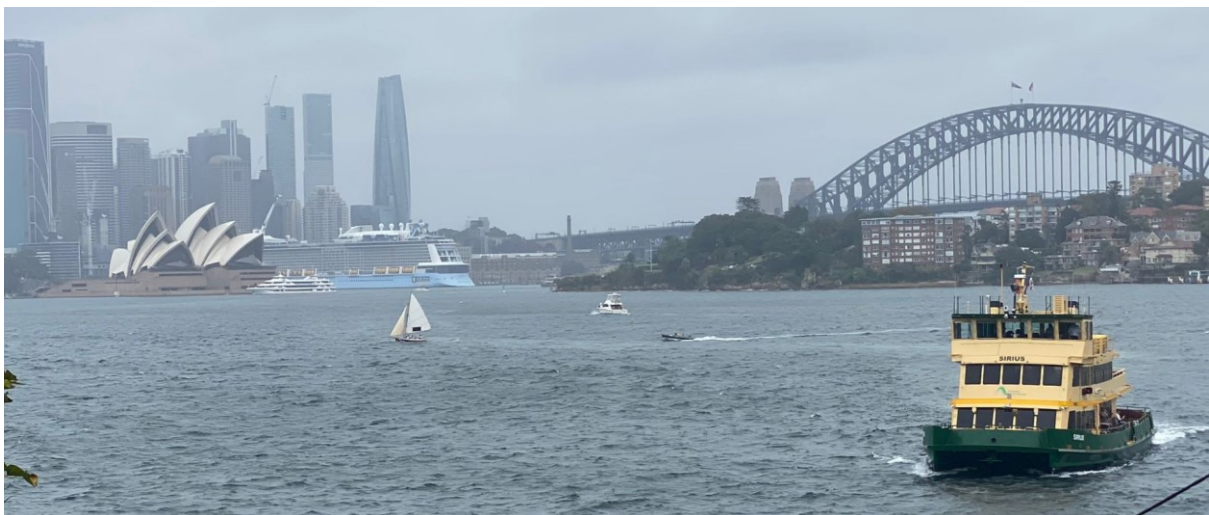
A good shot showing the rig on Australia.

Alas, the big winds did not eventuate leaving the boats under-rigged and becalmed at times.