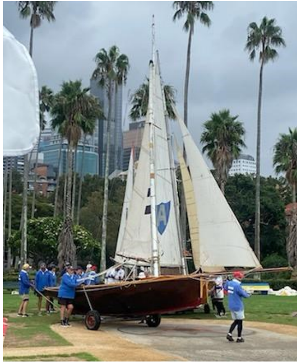
Tangles launching with Alruth chomping at the bit.