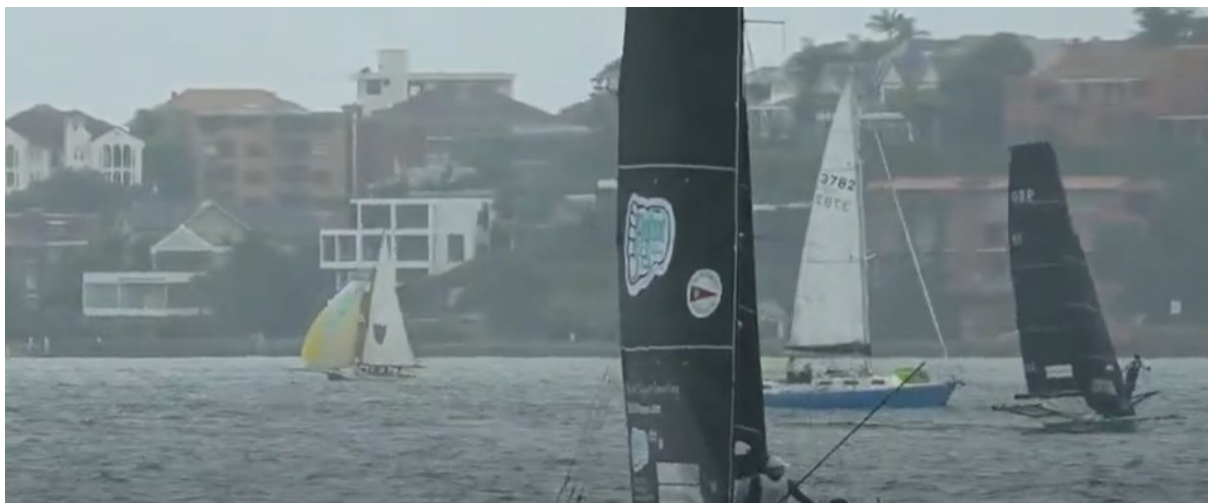
Alruth in hot pursuit of The Mistake and Tangalooma on the run from Clark Island to Chowder. Photo from YouTube.com:18footersTV: JJ GILTINAN CHAMPIONSHIP - Race 1 .