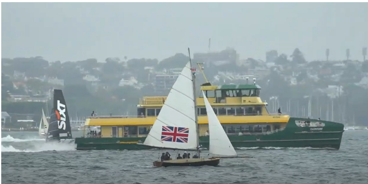
Top Weight (aka AUSIV).