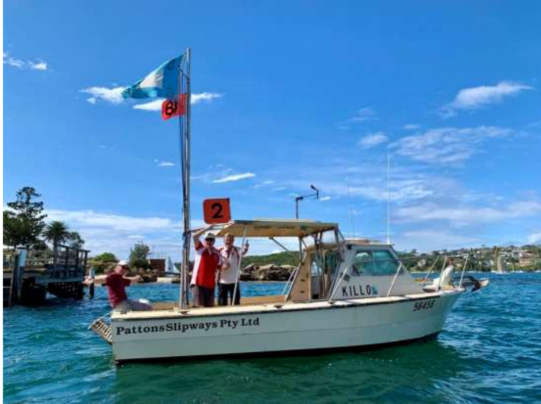
The Race officers on the Killo (Above)

And so, another lovely day on Sydney Harbour and only one more race to go. Thanks to the starters, the rescue boat crews and all the volunteers. We couldn't do it all without you!