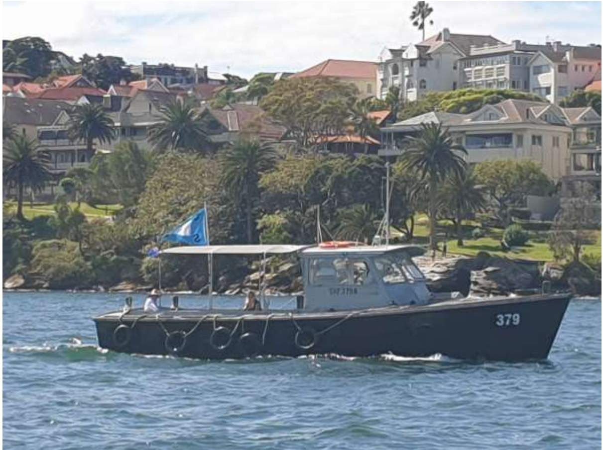
The SFS 'ferry'.