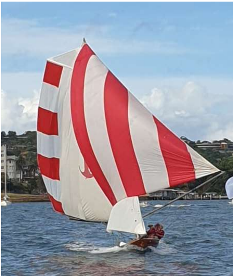
Yendys in full glory.

Continuing the good form that saw it win the Aussie Title again this year, Yendys stormed home to win the final handicap race of the season and the inaugural Mathew Flinders Race. In a light Easterly breeze, Yendys, off scratch, won by 3 minutes from Australia with Alruth a further 30 seconds behind in third place.