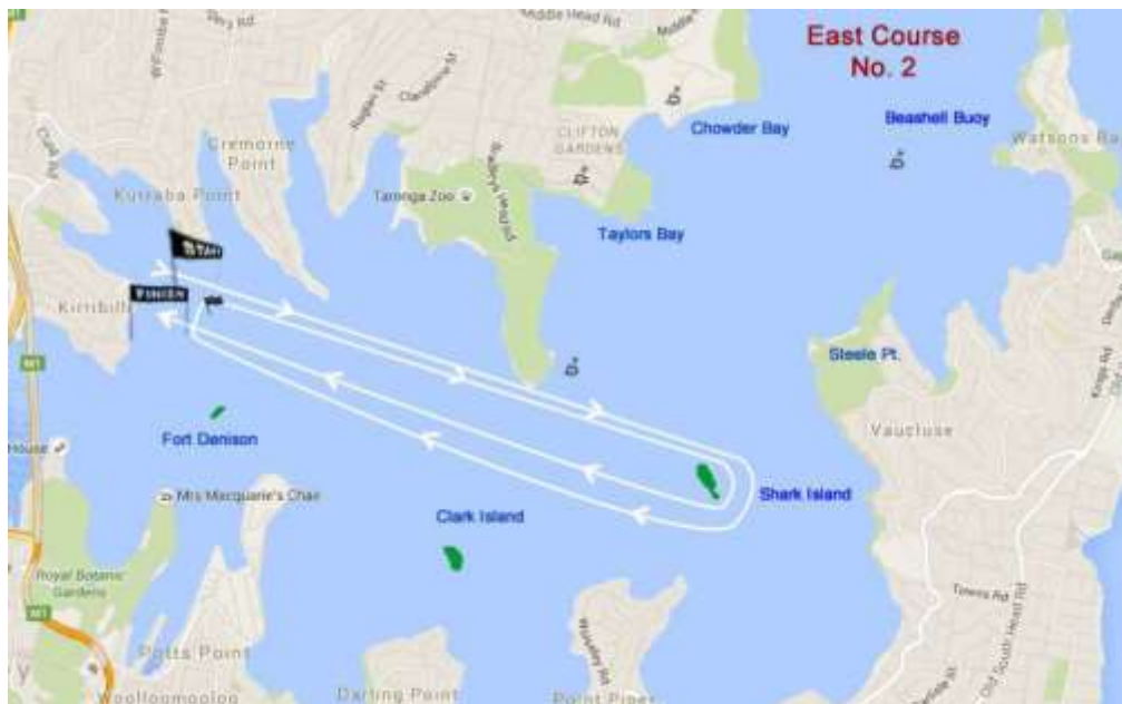
The No 2 course was selected by the Race Officers. Wind Direction on the day ESE 8-12 knots

Note: Australia IV crew sailing Top Weight due to damage to A4 during the season. Top Weight made available by the generosity of SFS ex-Commodore, John Tierney.