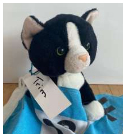
Trim the cat from Yendys.