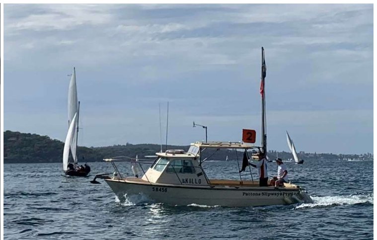
The Race officers keeping a close eye on the race