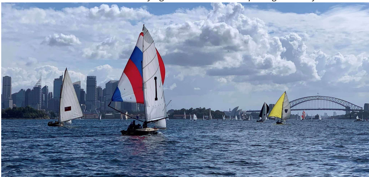
What a way to end the season!