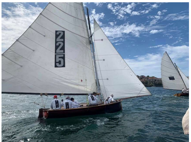
Photos of the Start (above and below).