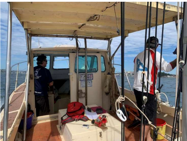
The Race officers on the Killo.

As always, the commitment and skills of the volunteers were on full display during the Season and for that, and for their excellent contributions socially as well, the sailors are most grateful. Thank you. We couldn’t do it without you!