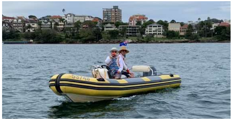
Barley and Dom on the gemini.