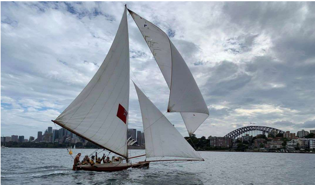
Photos of the finish (above and below).