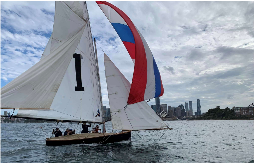
Top Weight with ringtail 'set'.