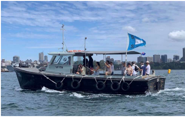
The 'ferry'