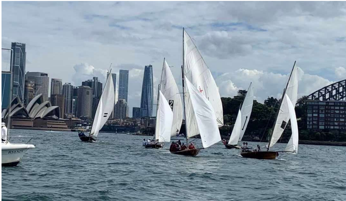
Gearing up for the start of the final race of the 2023-2024 Season.