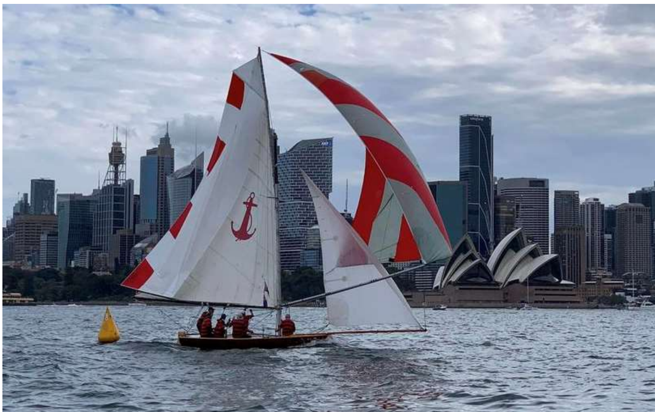
The finish line (above and below).