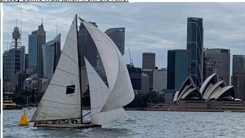
Australia finishing 3 rd .