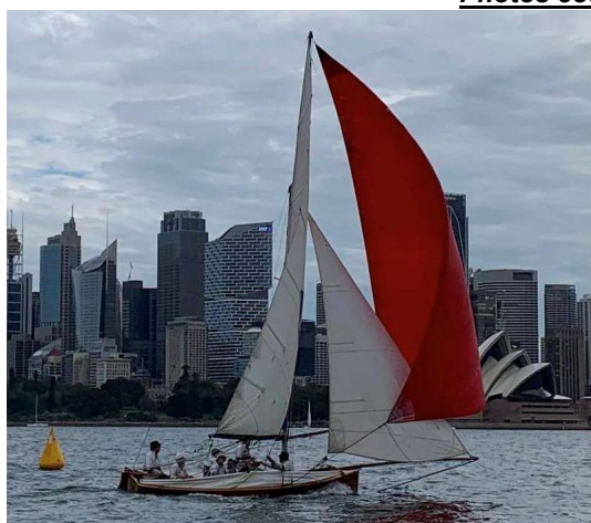
Alruth in 2 nd place