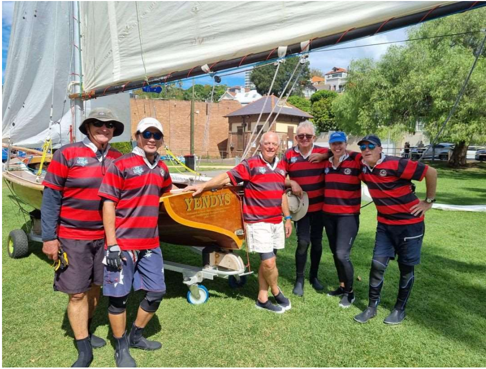
Winners are grinners.