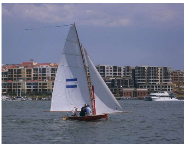
Image of Merle, 10foot skiff.