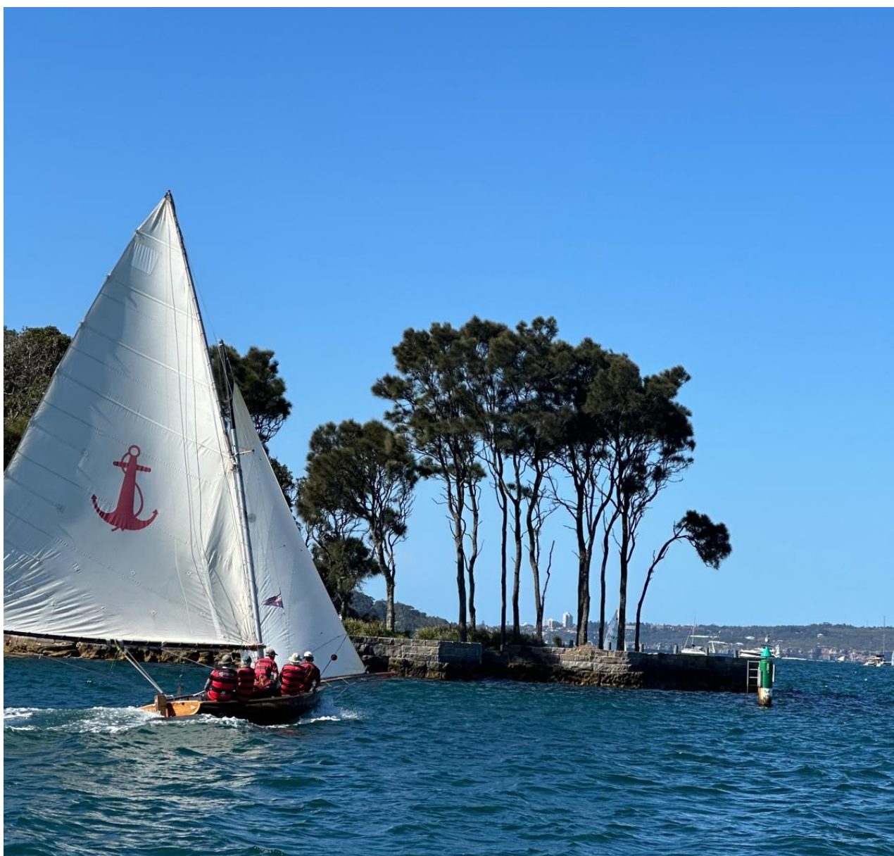
Yendys rounding Clark Island in first for the run to the finish.

Yendys broke her port lee cloth strut which the crew were able to repair prior to the start, but the broken main sheet block was repaired during the course of the race. Clever lads (and ladette)!!