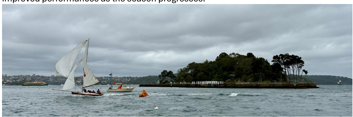
Yendys crossing the finish line.

At the Clark Island mark it was Yendys leading from Alruth, Australia, Top Weight and Tangalooma with Mistake bringing up the rear. The shorter work up to Chowder Bay and the run to Shark and then to the finish did not change the order. Alruth kept up her good form in the race and increased her lead over the following fleet to finish 7 minutes behind Yendys and 5 minutes ahead of the 3<sup>rd</sup> placed Australia. Top Weight was a further 40 seconds behind Australia with Tangalooma showing excellent form to finish just over a minute behind the consistent Top Weight. Mistake had trailed the fleet all race but is showing signs that its new crew can survive a tough nor'easter and look forward to improved performances as the season progresses.